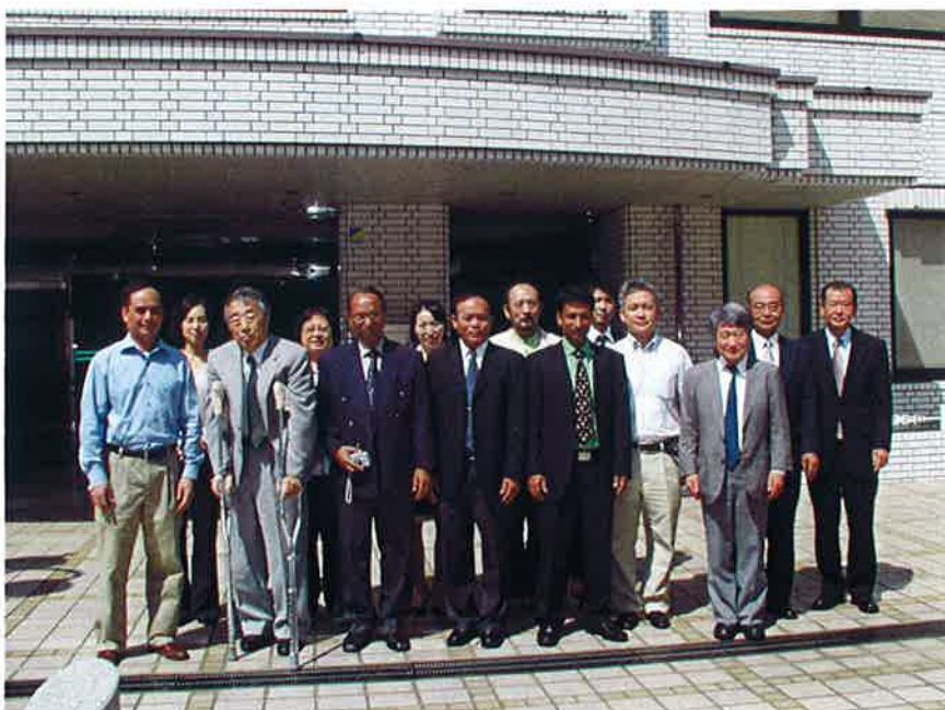
International Workshop group photo

Presentations were made to report on “the characteristics and disclosure status of official micro data statistics” of the participating countries by the government officials from Statistics Bureau of Bangladesh, Cambodia, Vietnam and Japan